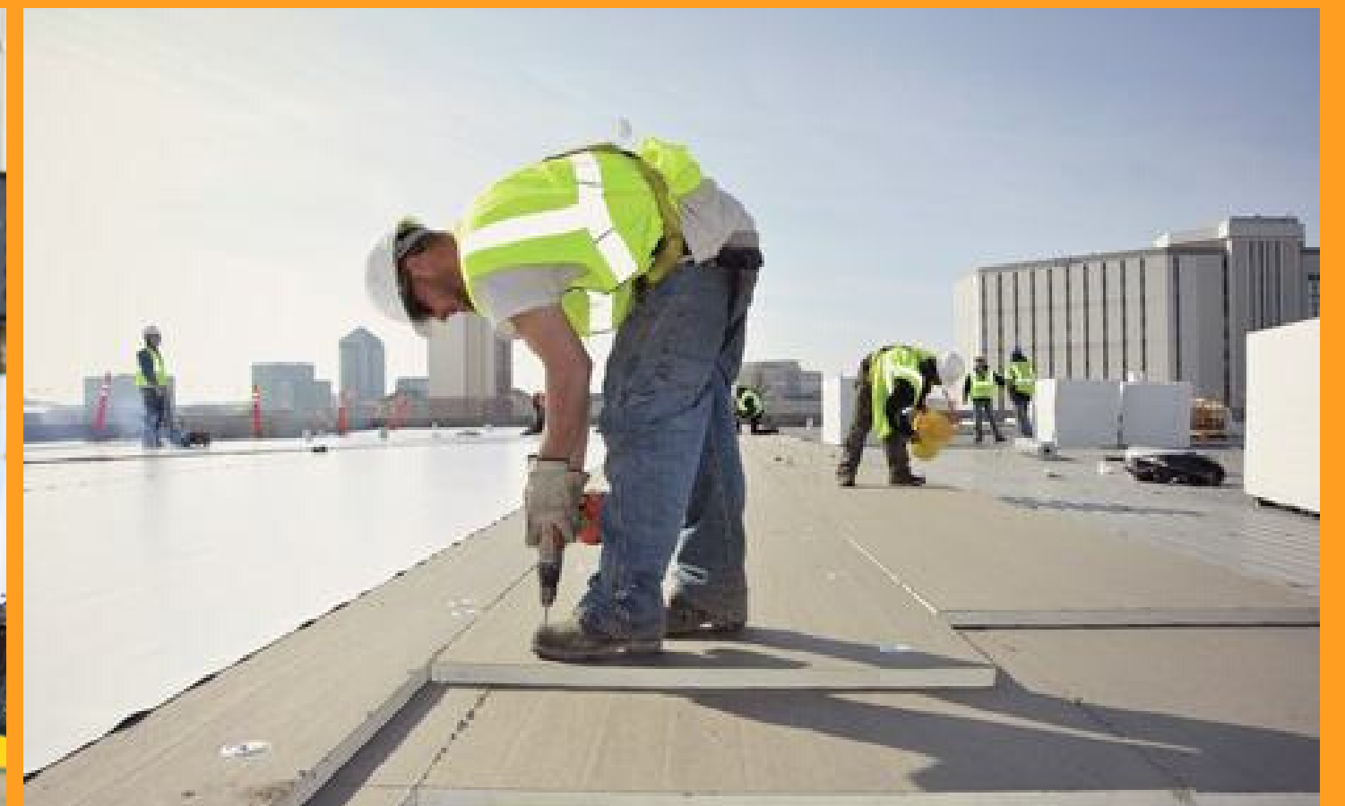
ROOFERS Local #22 (585) 235-0080 | www.rooferslocal22.com