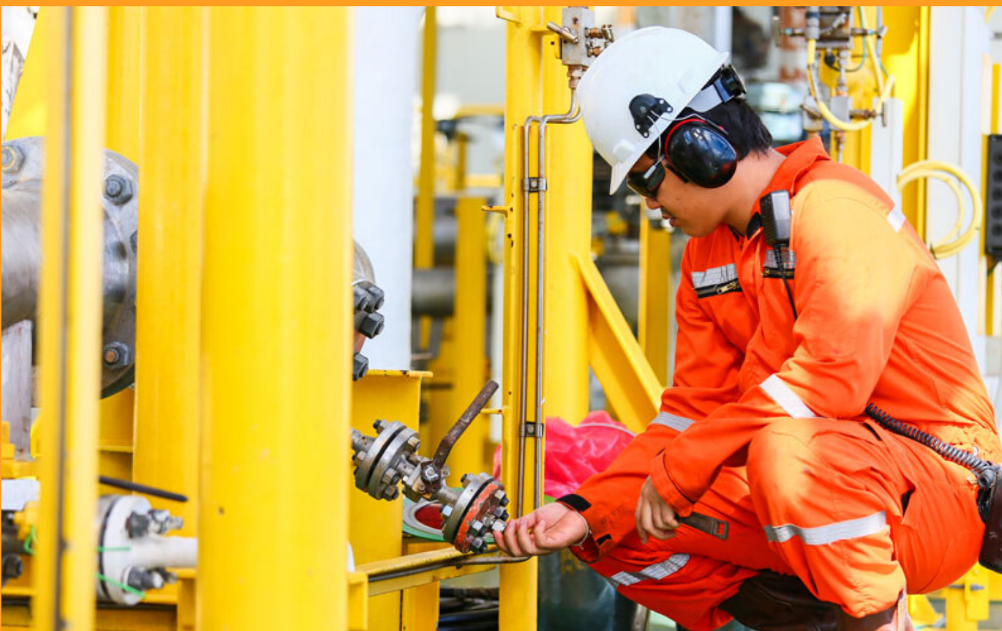
MILLWRIGHTS Local #1163 (315) 949-7031 | www.local1163.com