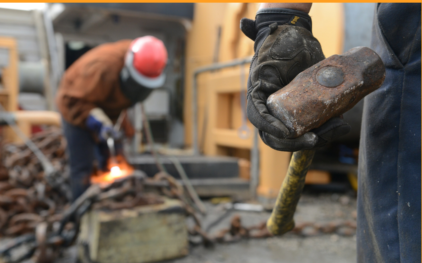
CONSTRUCTION LABORERS Local #435 (585) 546-8460 | www.local435.com