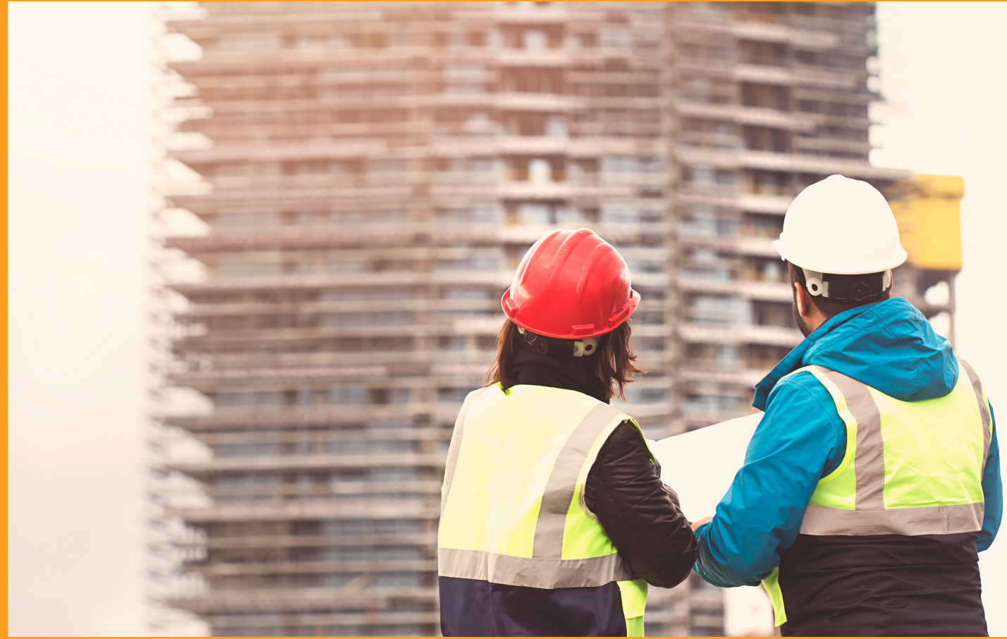
ELEVATOR CONSTRUCTORS Local #27 (585) 436-6440 | www.iuec.org