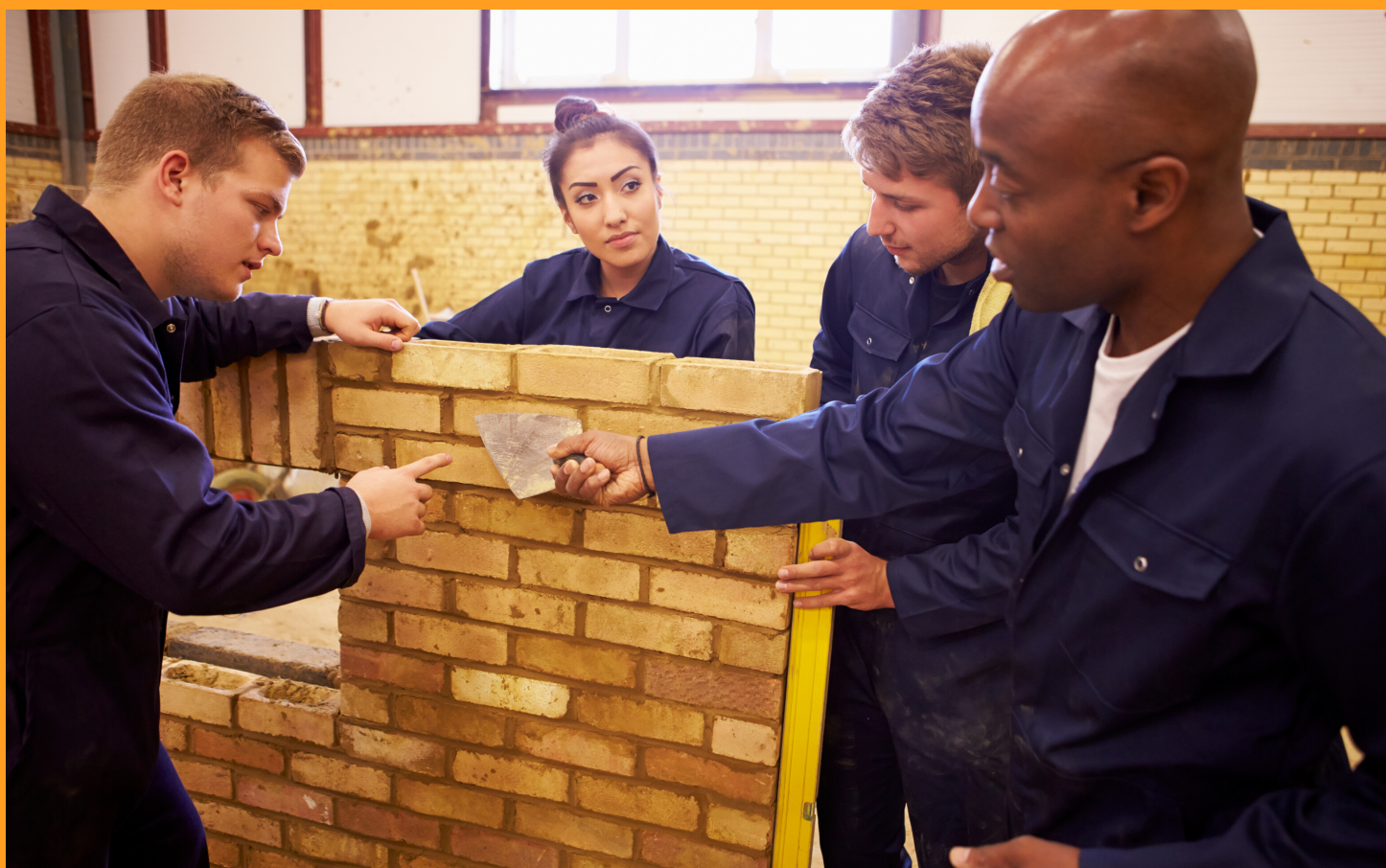
BRICKLAYERS & ALLIED CRAFTWORKERS Local #3 (585) 641-0750 | www.baclocal3ny.com