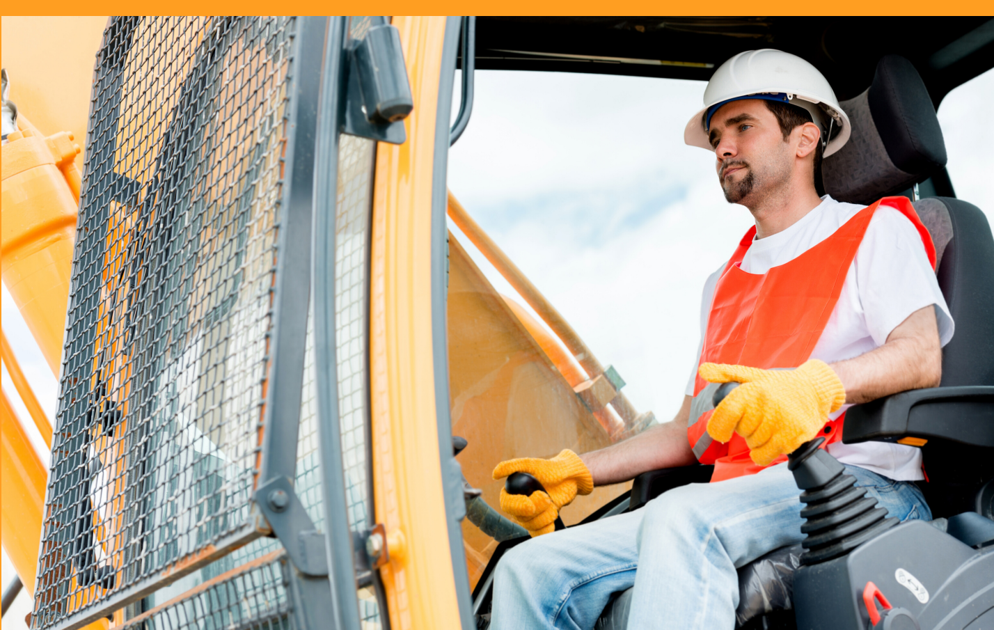
OPERATING ENGINEERS & EQUIPMENT OPERATORS Local #158 (518) 431-1044 | www.iuoe158.org