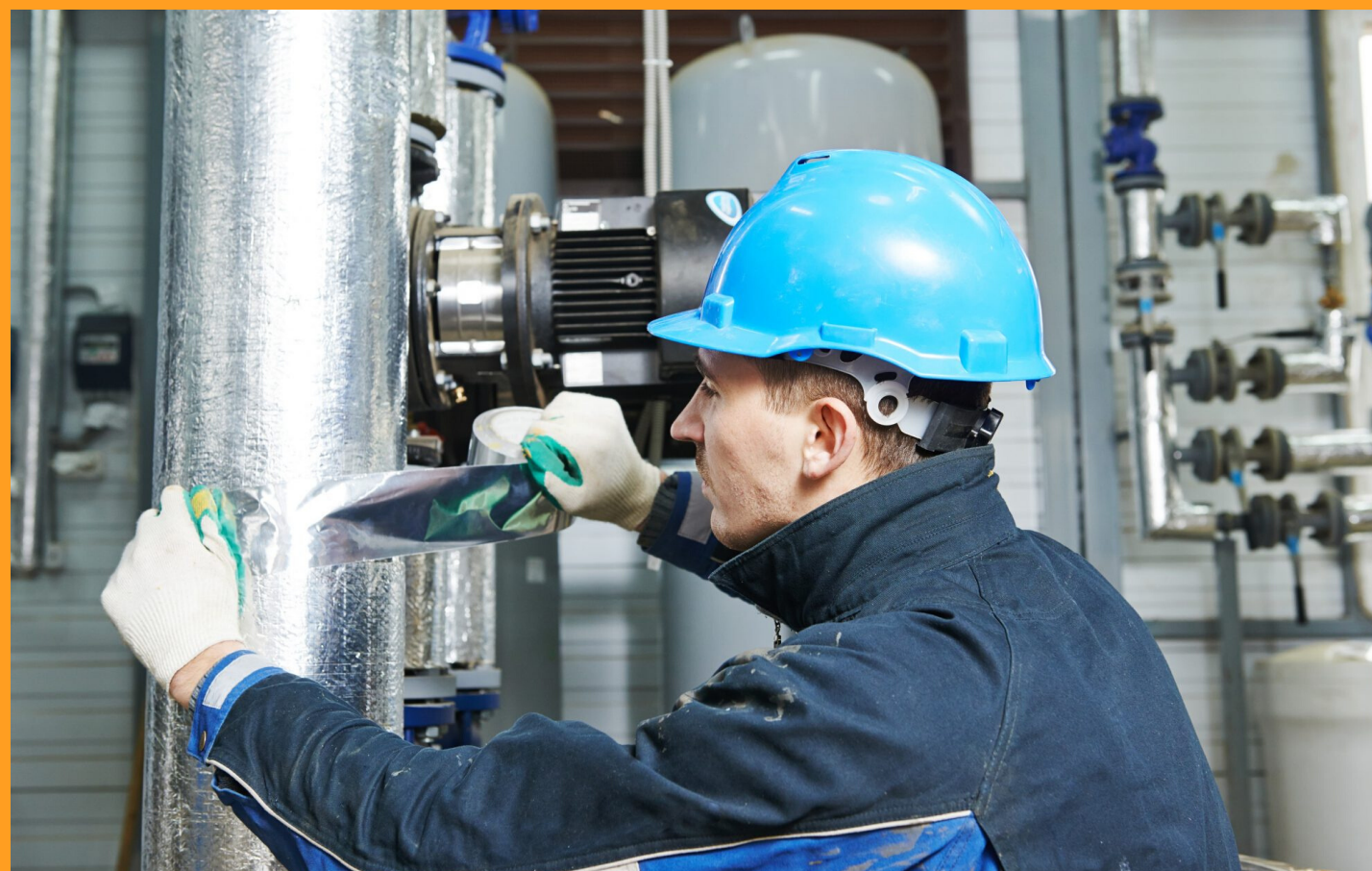
INSULATORS Local #26 (585) 323-1620 | www.insulators26.com