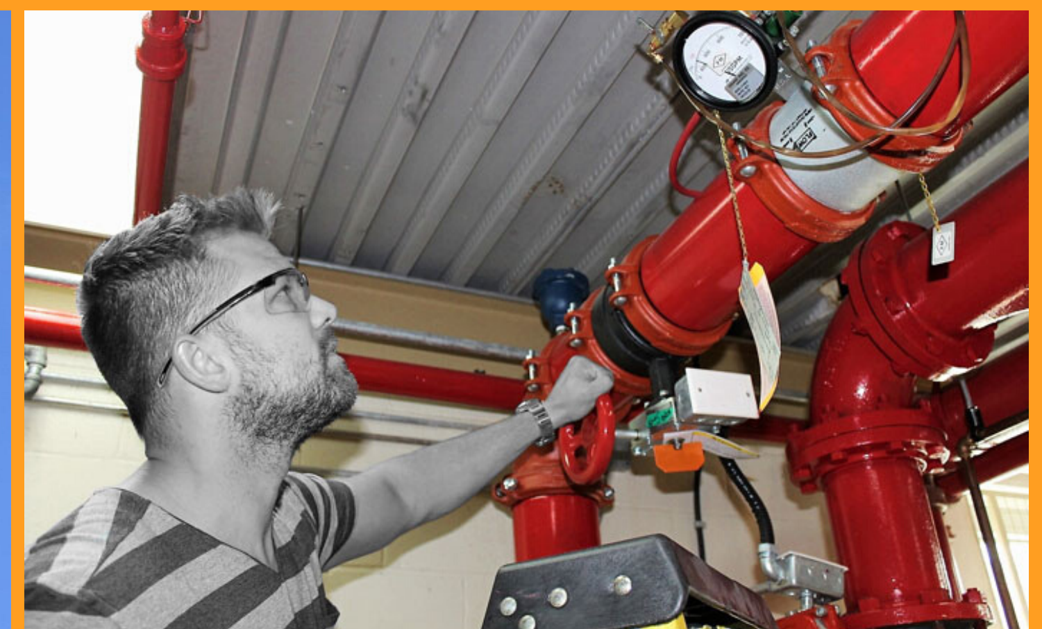
ROAD SPRINKLER FITTERS Local #669, (410) 381-4300 | www.sprinklerfitters669.org