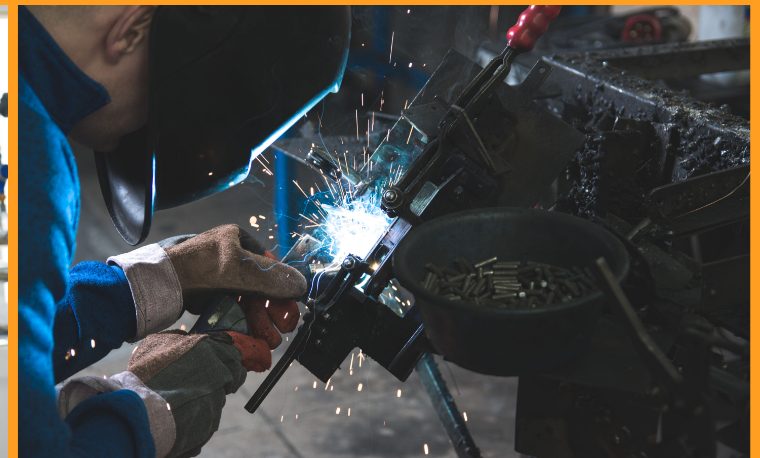
PLUMBERS & PIPEFITTERS Local #13 (585) 338-2360 | www.ualocal13.org