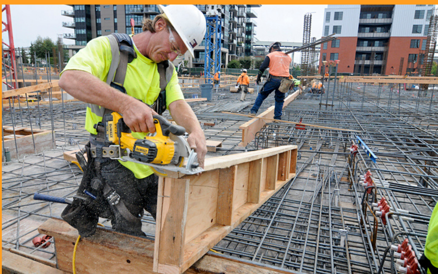
CARPENTERS Local #276 (585) 436-1110 | www.carpenterslocalunion276.com