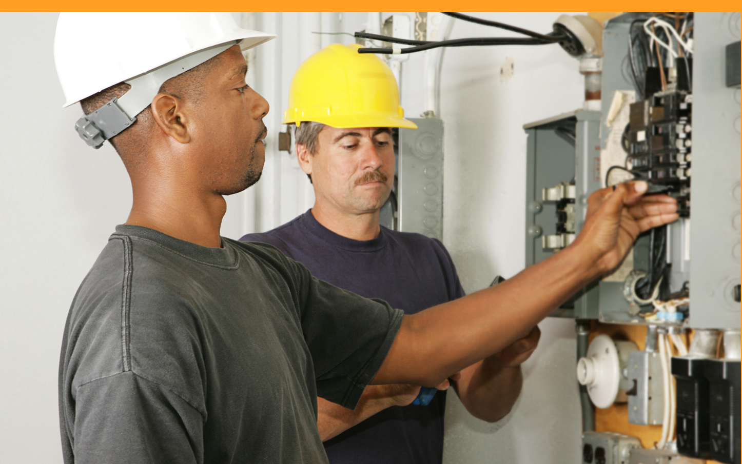
ELECTRICIANS Local #86 (585) 235-5050 | www.ibewlu86.org