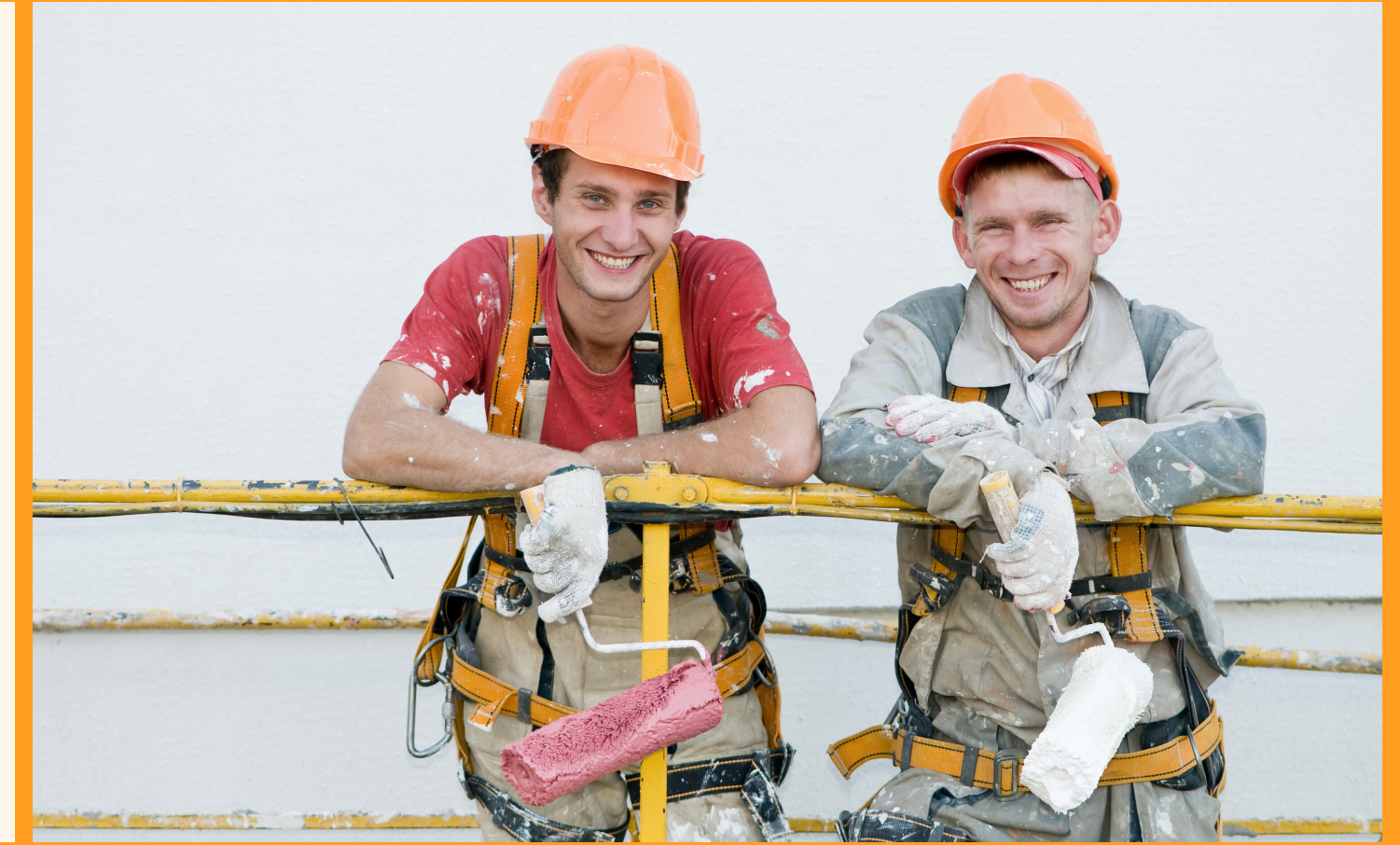
PAINTERS & ALLIED TRADES District Council #4 (716) 565-0303 | www.dc4.org