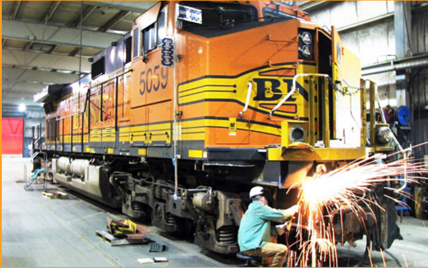
BOILERMAKERS Local Lodge #7 (716) 667-0861 | www.boilermakerslocal5.com/zone-7