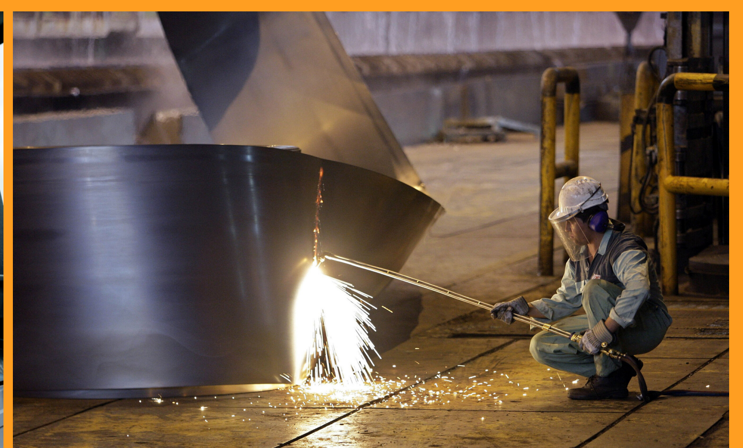
SHEET METAL, AIR, RAIL, TRANSPORTATION Local #46 (585) 254-9151 | www.smw46.com

VISIT UNICONROC.COM FOR MORE INFORMATION